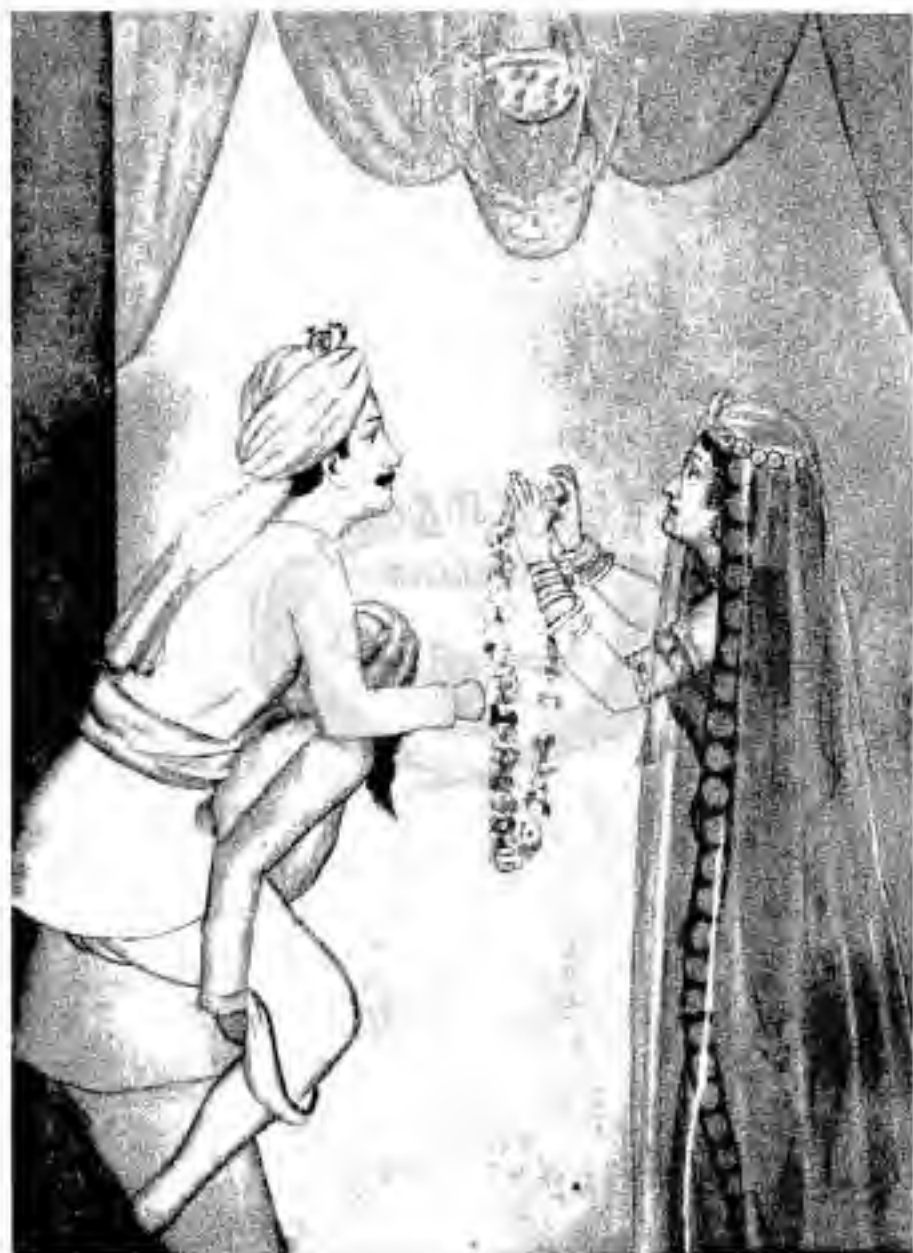
"She put the garland round the neck of the strand ."